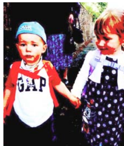
Fig. 9 The two youngest members of our congregation

There are 47 names on the electoral roll. The congregation at the Sunday Mass since the interregnum is averaging around 30, and 12 for mid-week. We have a fortnightly Sunday School, which join the Sunday Mass at the Offertory.