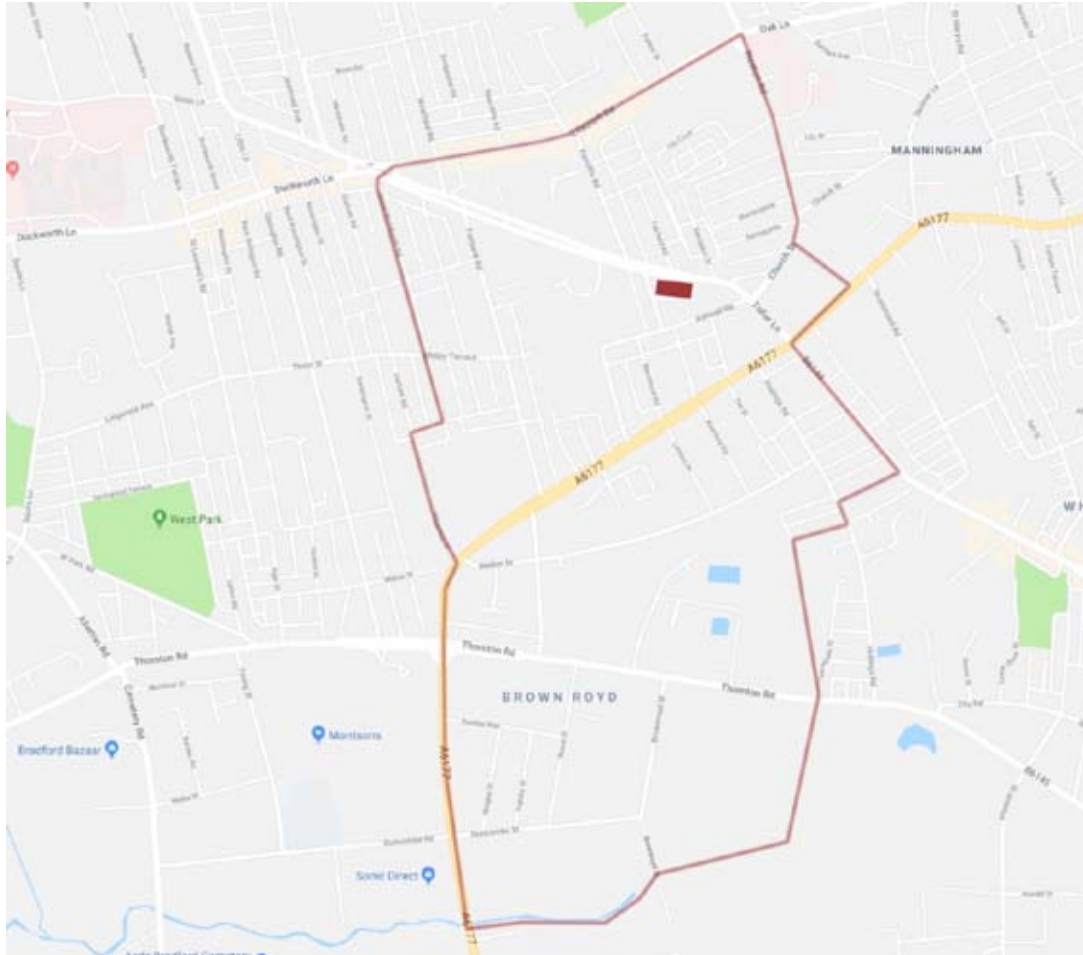
Fig 1 below shows a plan the parish boundary.

The top two thirds of the parish is predominantly housing, and represents a densely populated area, whereas the bottom one third is given over to more industrial and retail properties.