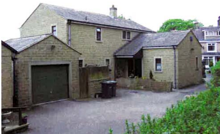
Fig. 7 Vicarage

This is a modern property, built circa 1990 in stone with slate tiled roof of single storey construction, being is set within the church grounds to the south east immediately adjacent to the Vicarage to the west (see Fig 4). Access is shared with the Vicarage from St Chad's Road, and there is parking for several cars. The hall itself has male/female toilets, one of which is a disabled toilet, a meeting area, kitchen and main hall, which is licensed for 50 people (see Fig 8).