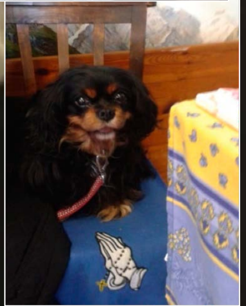
Waiting patiently at the May Fair 2017