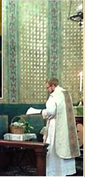
The Blessing of Lilies on the Feast of S. Antony of Padua 2018