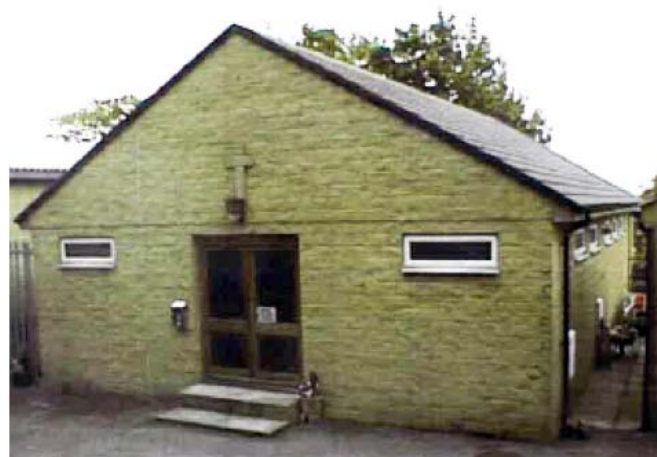
Fig. 8 Church Hall