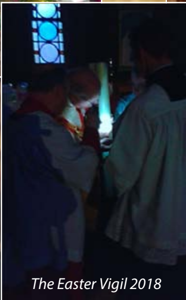
The Easter Vigil 2018