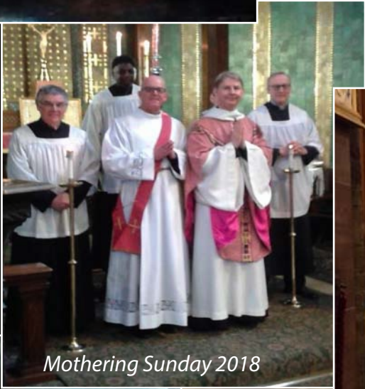
Mothering Sunday 2018